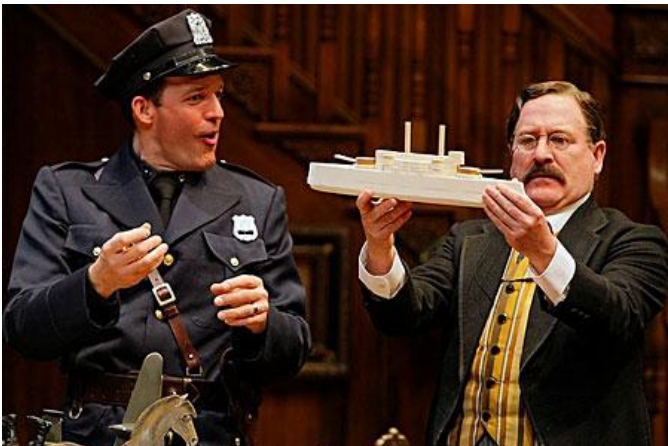
A little color, which is interesting. Don't like it though. Great cop, by the way. Leather holsters possible?