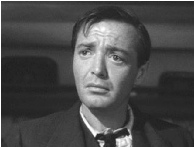
Hard to escape Capra's vision for the appearance.