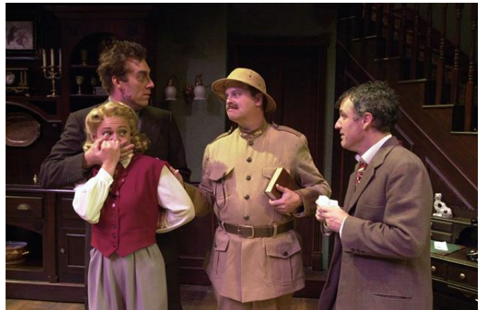
All set for Panama. This works very well.