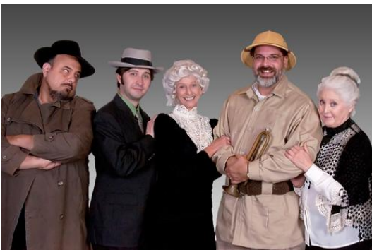
Utterly artificial, the lot of them.