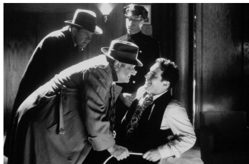
A long tan trench coat is my ideal for Rooney.