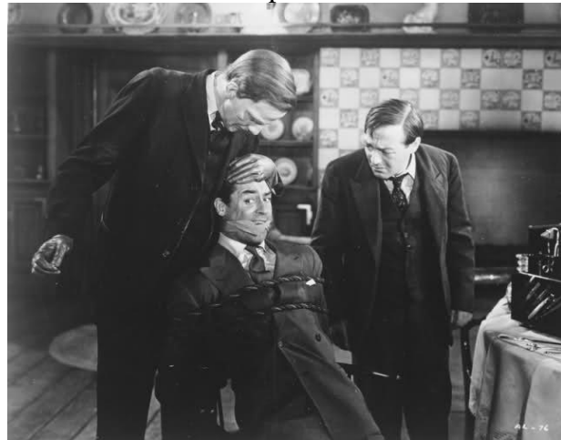
And another view of Peter Lorre's Einstein.