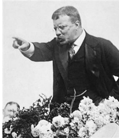
There's our true mark.