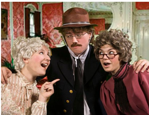
Roughrider look. Waaay too hokey.