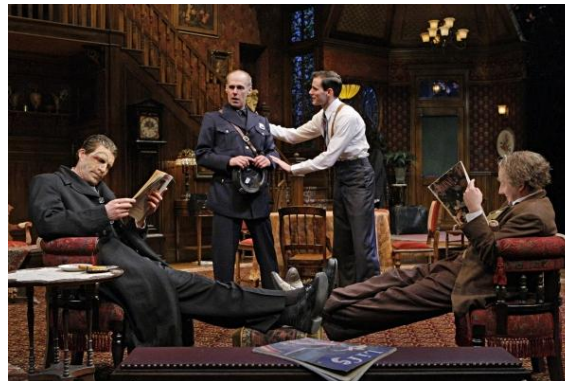
LOVE the idea of a long, flowing black overcoat.