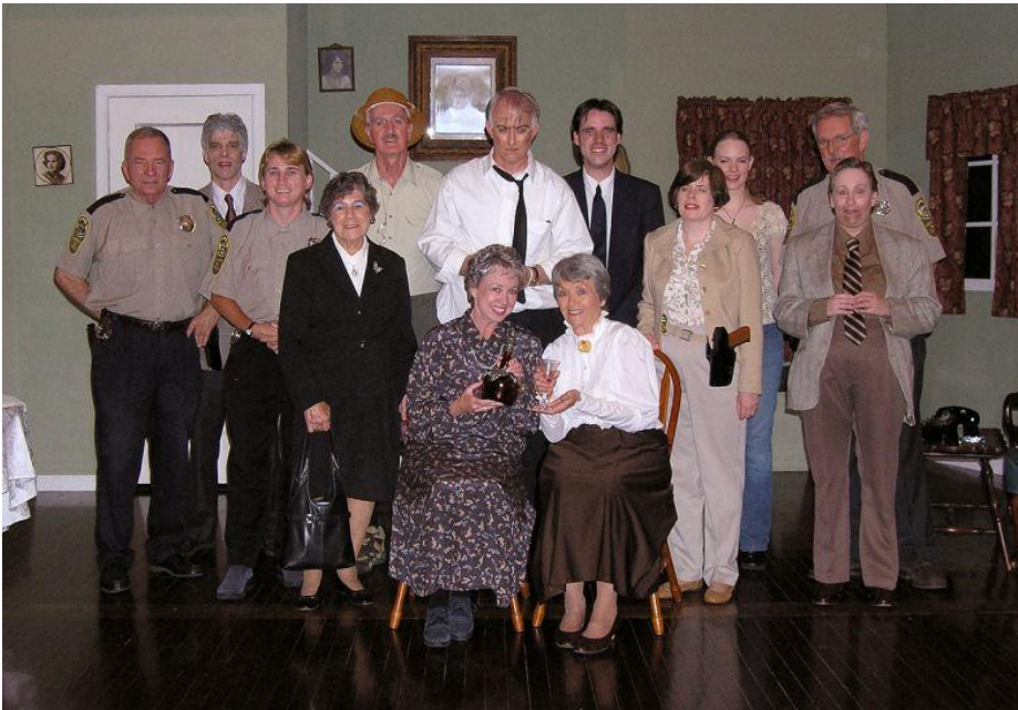
Utter grunge. Too much, but interesting.

Einstein, as stated, is very clearly written. He's a sloppy, god-awful mess. Honestly, the image immediately below might be a tad bit too excessive, but it's the closest to what I'm looking for. I don't want to go this far, but she should definitely not look like a person you'd wanna stand too near for long.