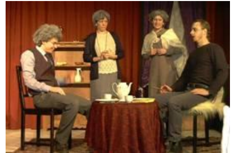
This really does look like Al Einstein Nope.