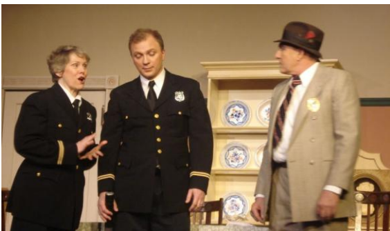
Rooney should appear in plain clothes.