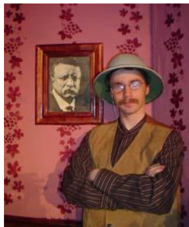
Way too informal. Nope.