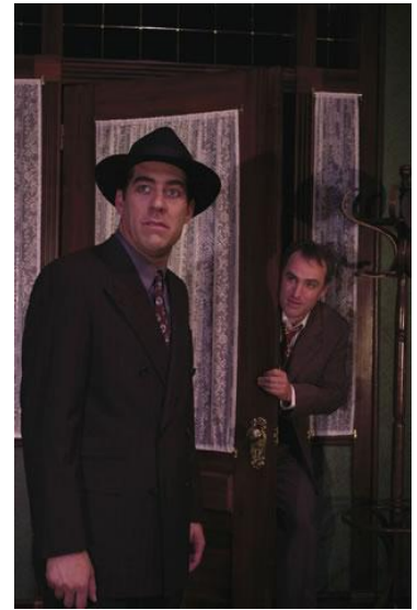
Though to see, but not bad.