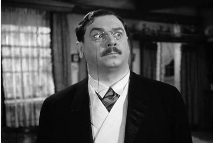
Love this outfit in the film.

Teddy is another problematic figure. I really want to edge him more towards the formal side of the spectrum in most cases. I really see his open as being VERY formal. Most of the character's physical appearances escape their film incarnations very well for me. Teddy is not one of them. I love his opening costume in the film version. I'm also not positive I like the route of the pajama bottom. Slippers, yes. I think I may want to nix the outright PJ bottoms though. Teddy has several costume changes. He has his formal outfit, his safari outfit, and his "signing clothes". I think Teddy's costumes should speak to the level of a man whose utterly convinced of his ownership of this personality.